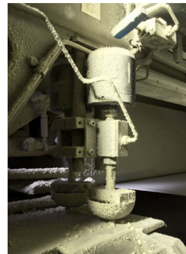
Older Paprima valve model