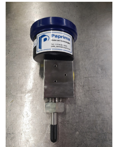
New Paprima valve model